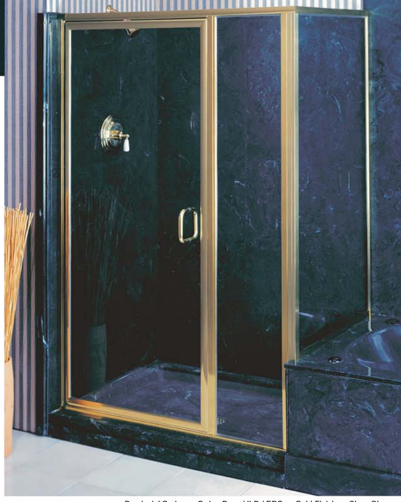
Provincial Series • Swing Door / ILP / ERS • Gold Finish • Clear Glass

Provincial Series • Neo-Angle Swing Door • Gold Finish • Clear Glass