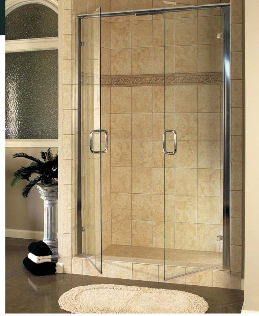
Hyaline Series • Double Swing Door • Chrome Finish • Clear Glass Hyaline Series • Swing Door • Brushed Nickel Finish • Flemish Glass