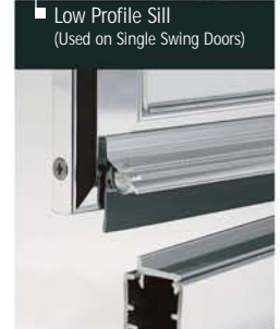
Aluminum Drip Rail with Vinyl Sill Sweep